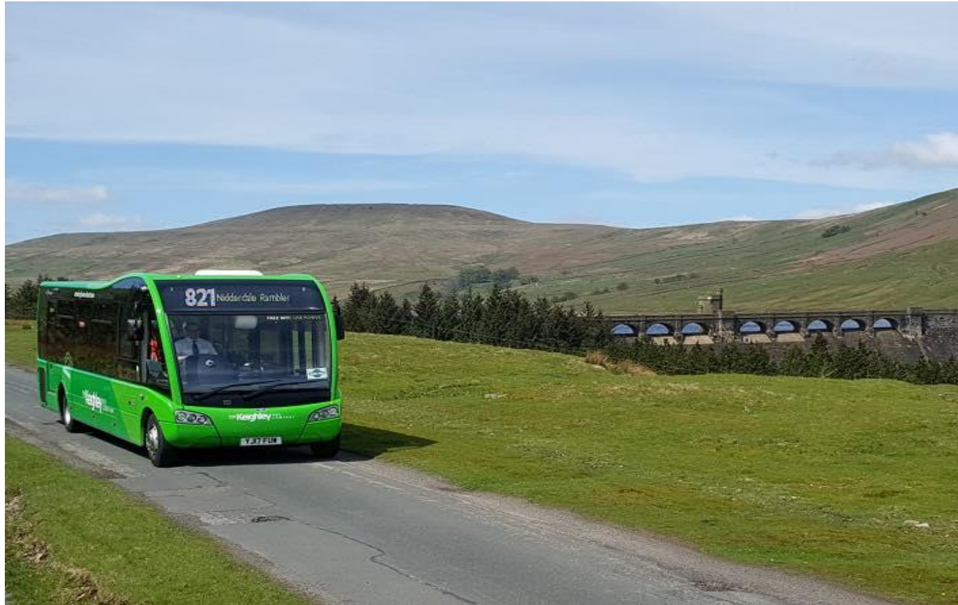
Nidderdale DalesBus 821 at Scar House Reservoir